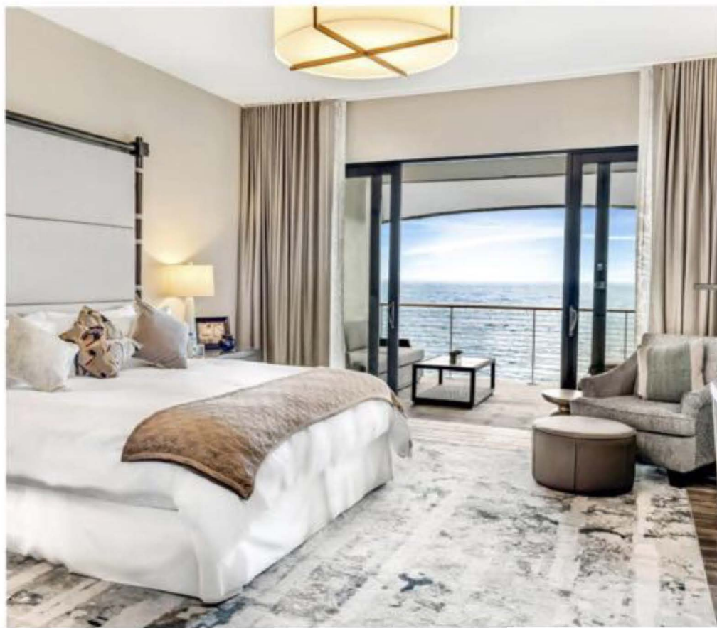
CLOCKWISE FROM TOP LEFT: The pool at the Rosewood Bermuda. Sense spa at the Rosewood. A room at the Loren. A statue by the artist KAWS outside the Hamilton Princess.